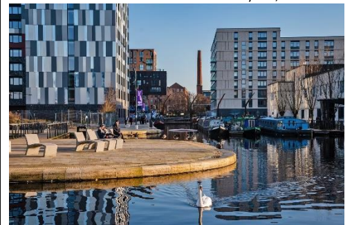
New Islington Marina – Ancoats: Day 2

We are now only 8 weeks away from the Club's major event of the year – Manchester in May and all the hard work in the background is coming together. Entries will go live on Racesignup within the coming days as will information about helper requirements and discount codes. The weekend offers a wide variety of orienteering activities that will appeal to experienced orienteers and newcomers alike. This year, for the first time, there will also be accessible courses on days 2,3 and 4.