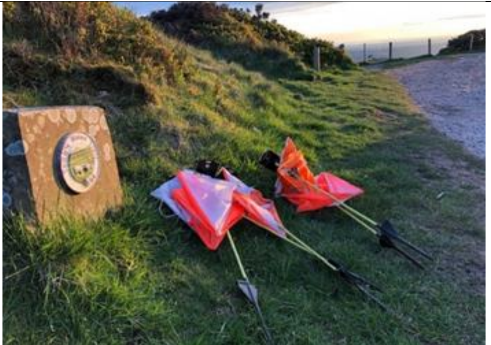
The sun always shines at Teggs Nose ☺

The team will be sending out a questionnaire shortly to get a sense of your likes, dislikes and must haves to inform the creation of our next kit design.