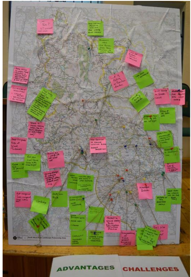
Figure 8. The finished Warslow map