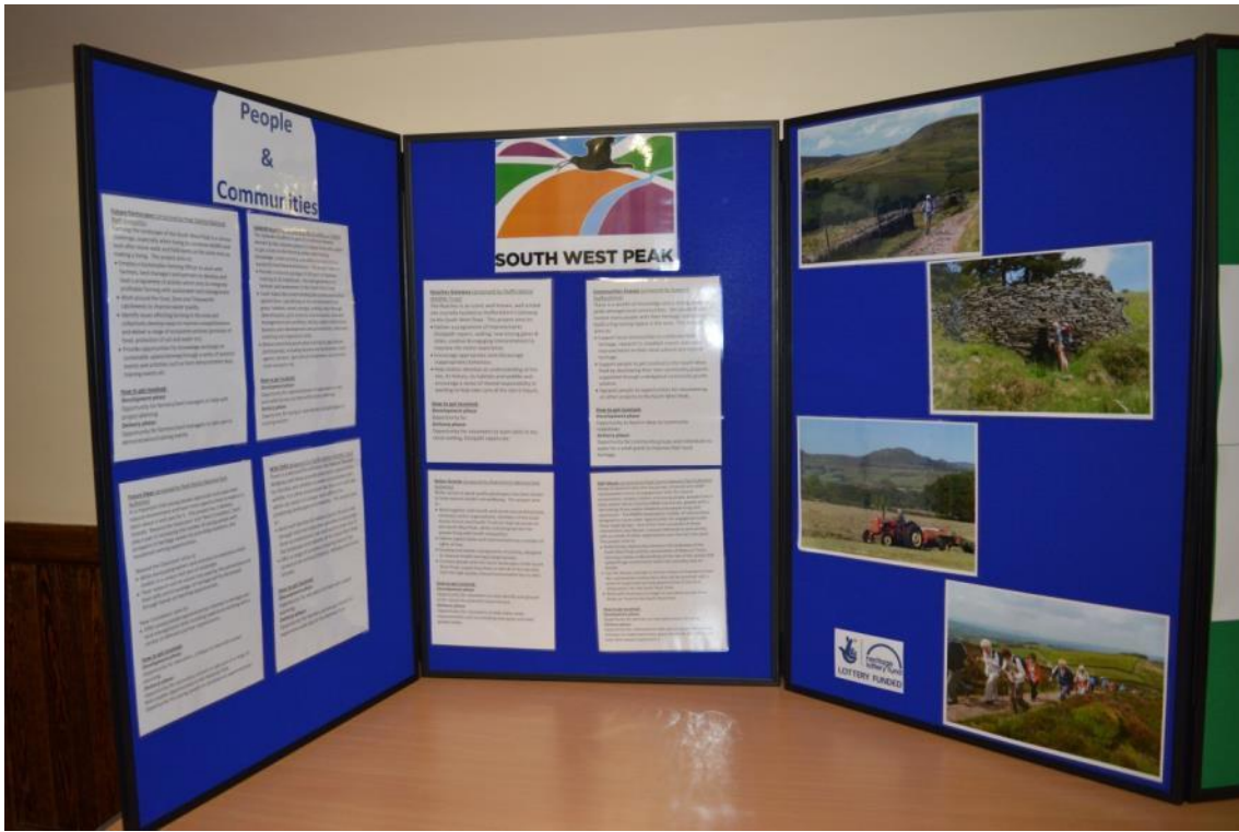
Figure 3. People & Communities projects display