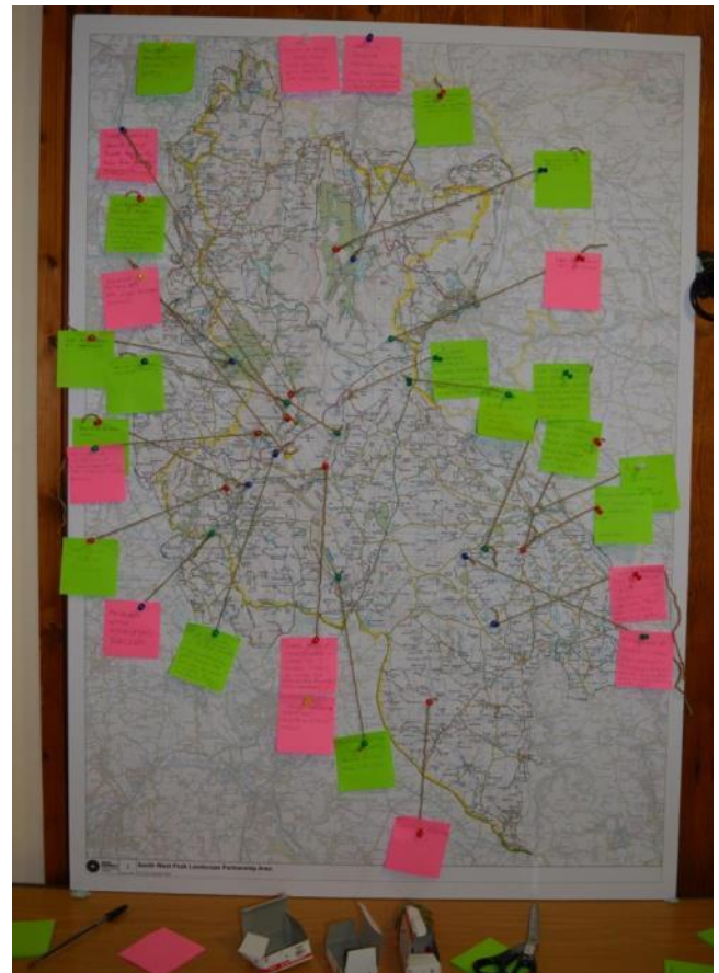
Figure 5. The finished map at Wildboardclough