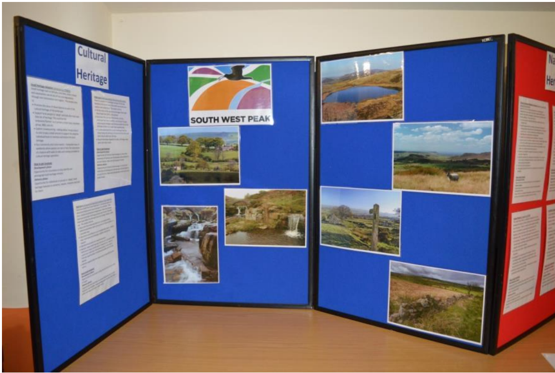
Figure 1. Cultural Heritage projects display