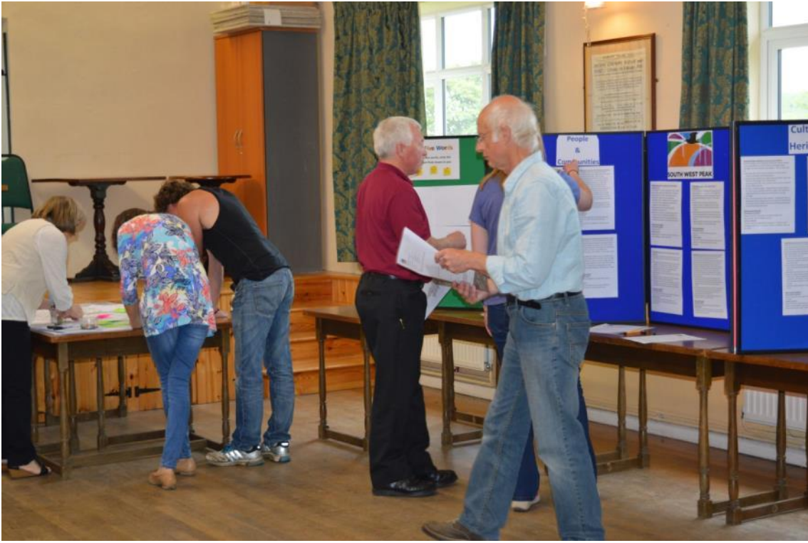
Figure 6. People taking part at the Warslow roadshow