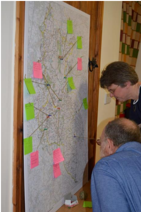
Figure 4. The map exercise at Wildboardclough