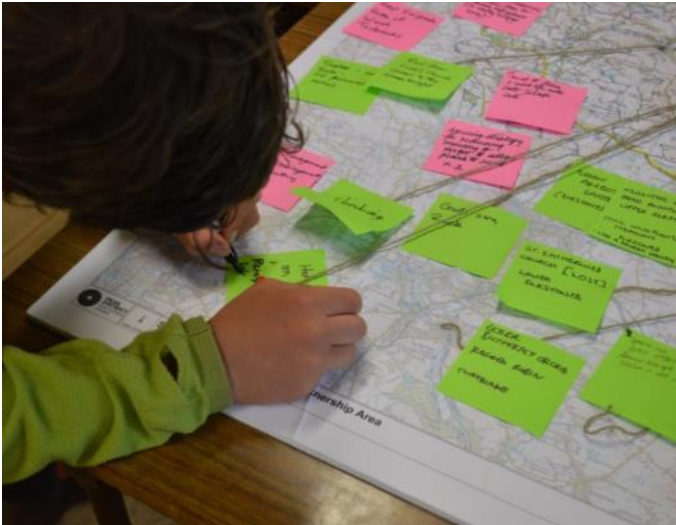
Figure 7. Enjoying the map exercise