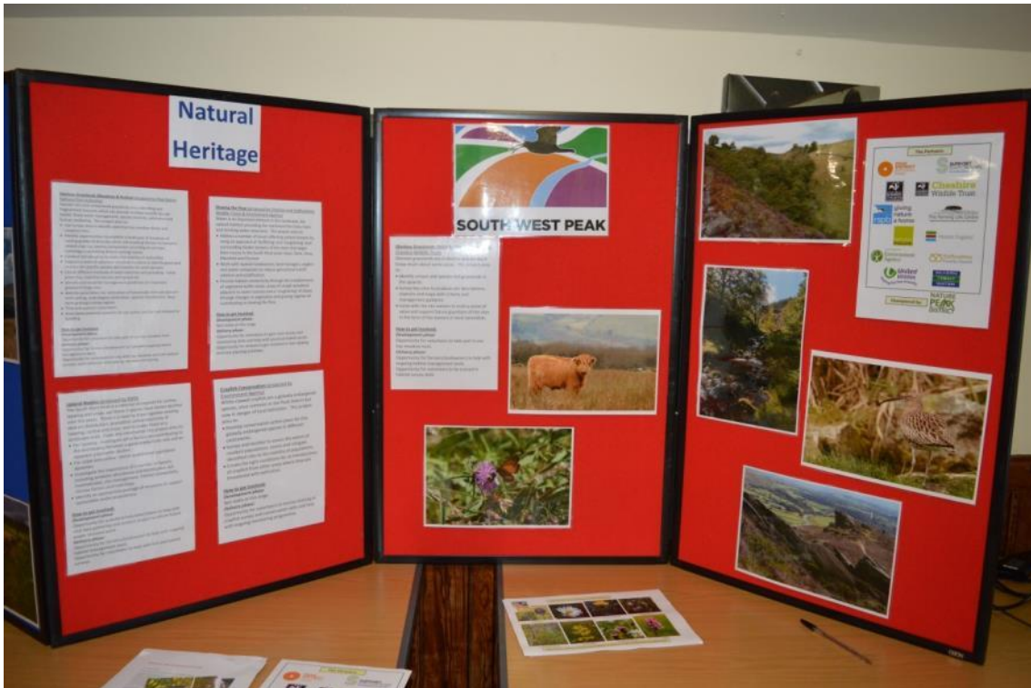
Figure 2. Natural Heritage projects display