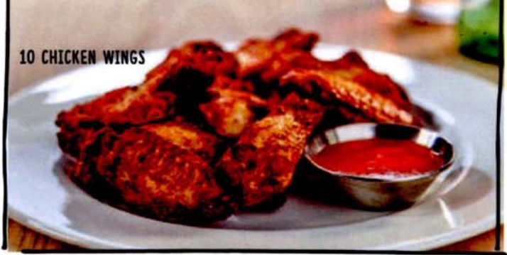
10 CHICKEN WINGS

CHICKEN WINGS CHOOSE FROM: BBQ, Frank's RedHot ® sauce.